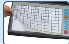
removable and renewable hot keypad (Patented)