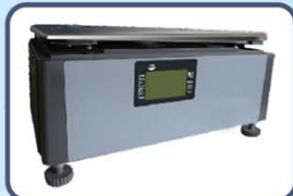
customer display (back of no-display-pole scale)