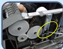
Pull out path (P-2)