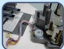
Printer model replacement (P-1)